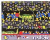
The Enchanted Underground

You can choose any of them in any order you wish by using the control pad to move left or right and then pressing the A Button when the picture from the realm you wish to visit appears in Whitebeard's crystal ball. The clock starts running when you arrive at each level, so search quickly!